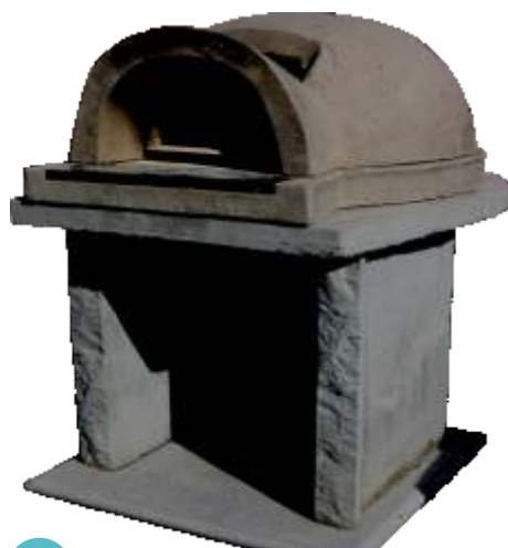
5 Put pizza dome onto brick floor