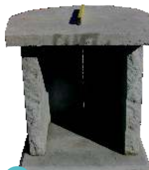
3 Level under floor on base