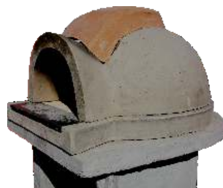
6 Put chimney dome onto pizza dome