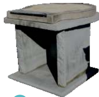
4 Place brick floor onto under floor