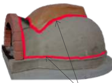
8 Seal with mix that comes with the oven (fiber sand , cement and add water )