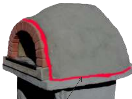
10 Seal joint all round