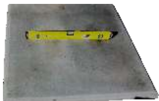
1 Level floor