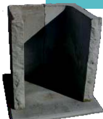
2 Place base on floor