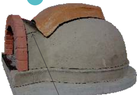
7 Place arch in front of pizza dome with wires underneath chimney dome and seal all joints outside