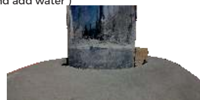
11 Place chimney onto chimney dome and seal