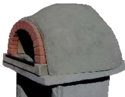
9 Place outer dome over pizza dome